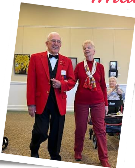
Red Day Fashion Show