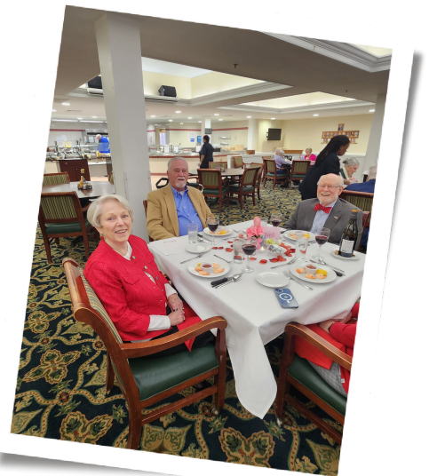
Valentine's Date Night Dinner