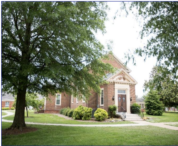
The Chapel at MAHOVA